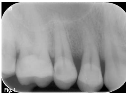
Fig. 1: Pre-operative periapical X-ray image evidenced dental fracture on 14.

During the above-described regenerative procedure, usually priority is given to the most coronal portion with the objective of limiting bone resorption, maintaining interproximal peaks if present, better managing gingival aesthetics and preventing invagination of soft tissue in the defect. Instead, our protocol provides for the positioning of biomaterial even before implant placement. This allows greater primary implant stability already during insertion. Also, in consideration of the fact that most of the existing fixtures are self-tapping, the macrostructure of the implant favours progression of the inserted particulate downward by first placing it in those areas of apical defect otherwise not easily accessible in the next phase. It should also be remembered that it is the more vascularised apical portion that originates the regenerative push that will then progress in the coronal direction, thus increasing the BIC. 34