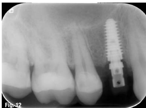
Fig. 12: Post-operative periapical X-ray evidenced the correct position of dental implant.

Finally, our findings are consistent with previous results, 14-16,29,36,37 showing that the insertion of biomaterial to fill the BIG even before insertion of the implant determine the best functional results in prosthetic-implant rehabilitation. Further investigation need to evaluate the resorption of the alveolar ridge associated with the placement of post-extraction implants using the surgical protocol described by the authors.